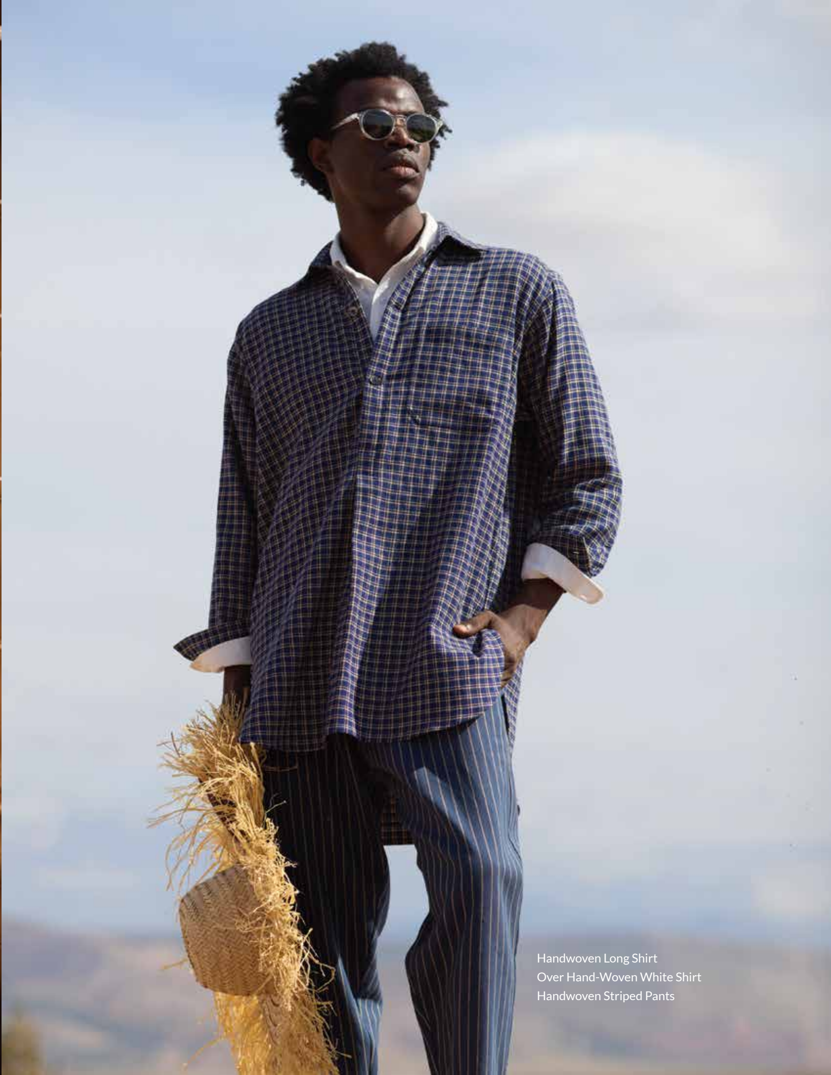
Handwoven Long Shirt Over Hand-Woven White Shirt Handwoven Striped Pants