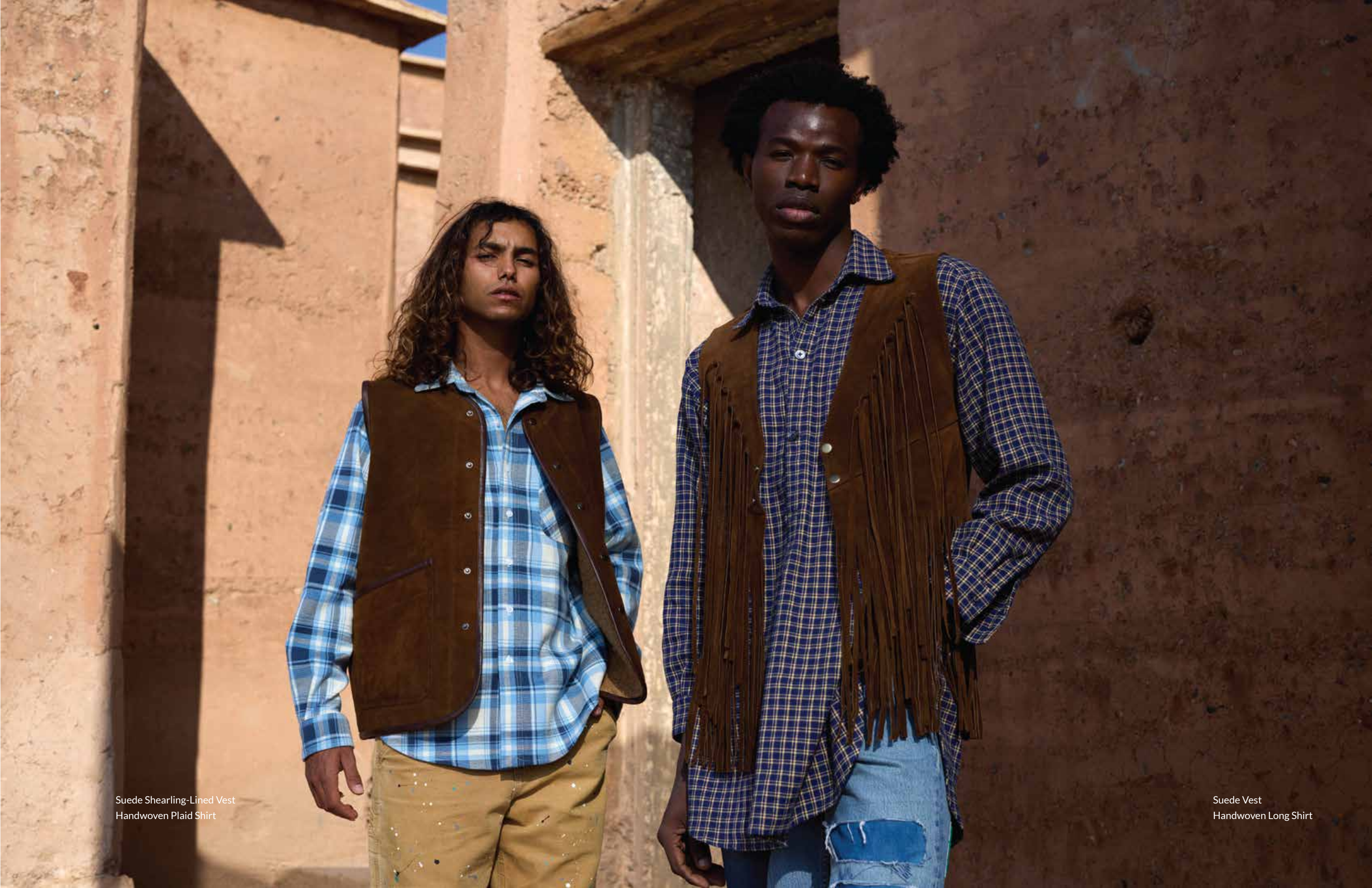
Suede Shearling-Lined Vest Handwoven Plaid Shirt