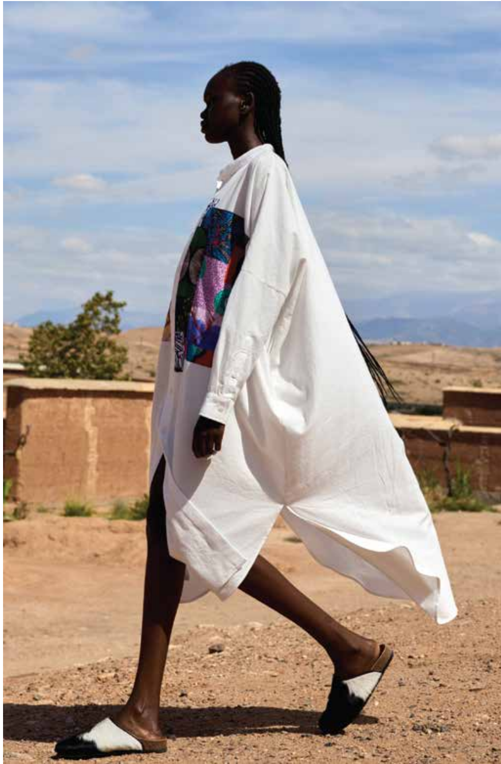
Handwoven White Patched Kaftan