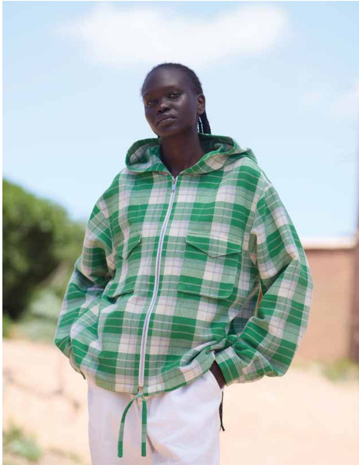
Handwoven Plaid Hoodie