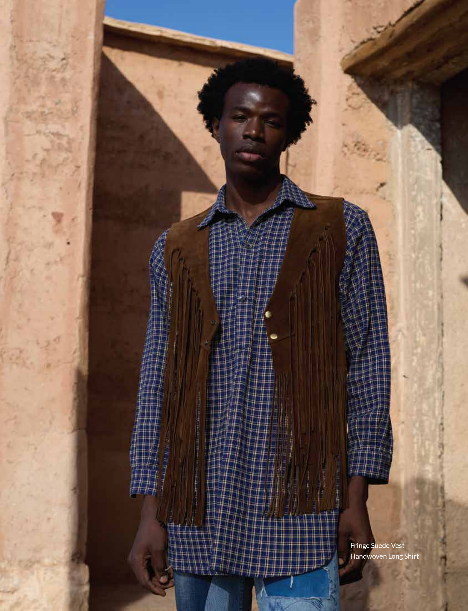
Fringe Suede Vest Handwoven Long Shirt