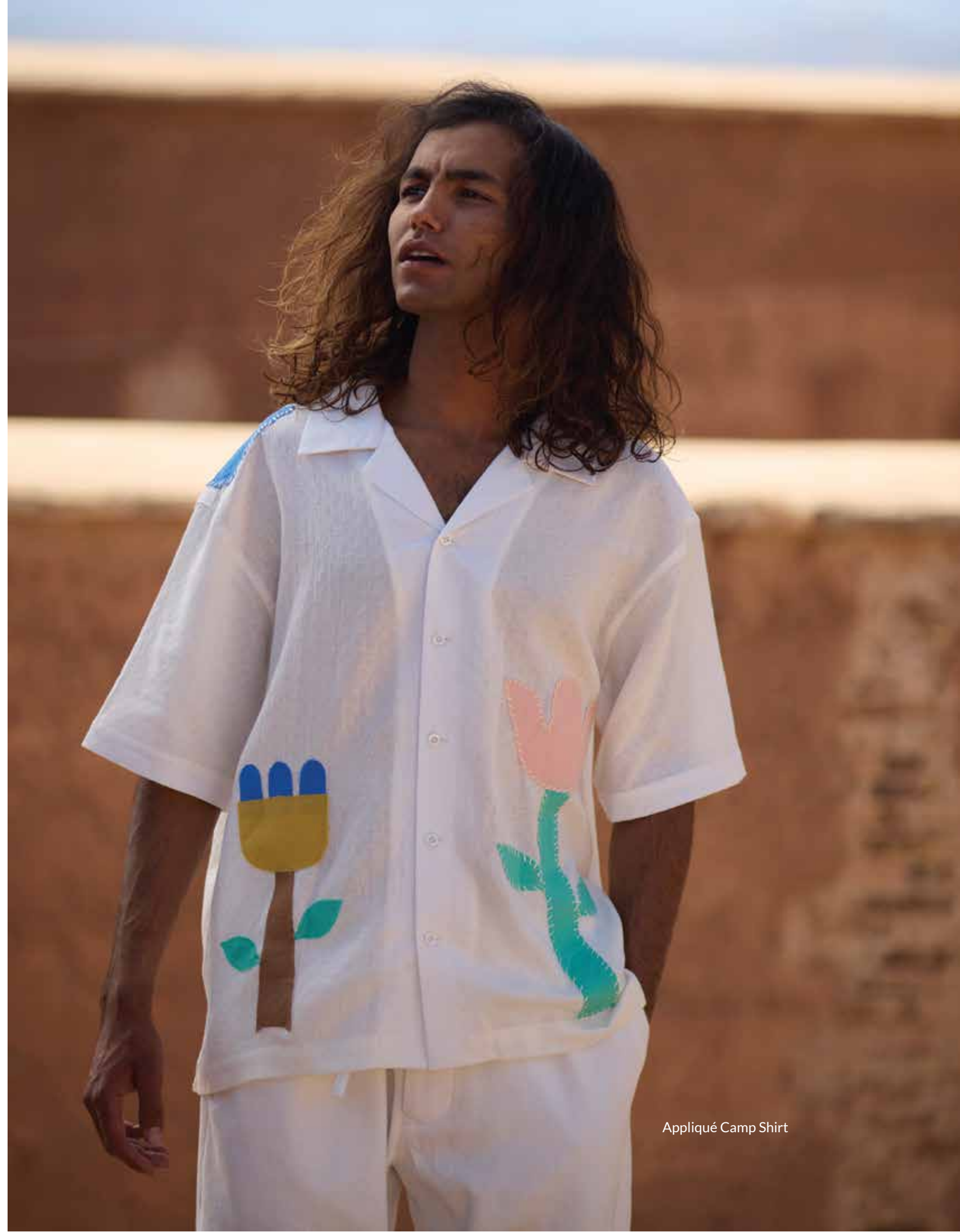
Appliqué Camp Shirt