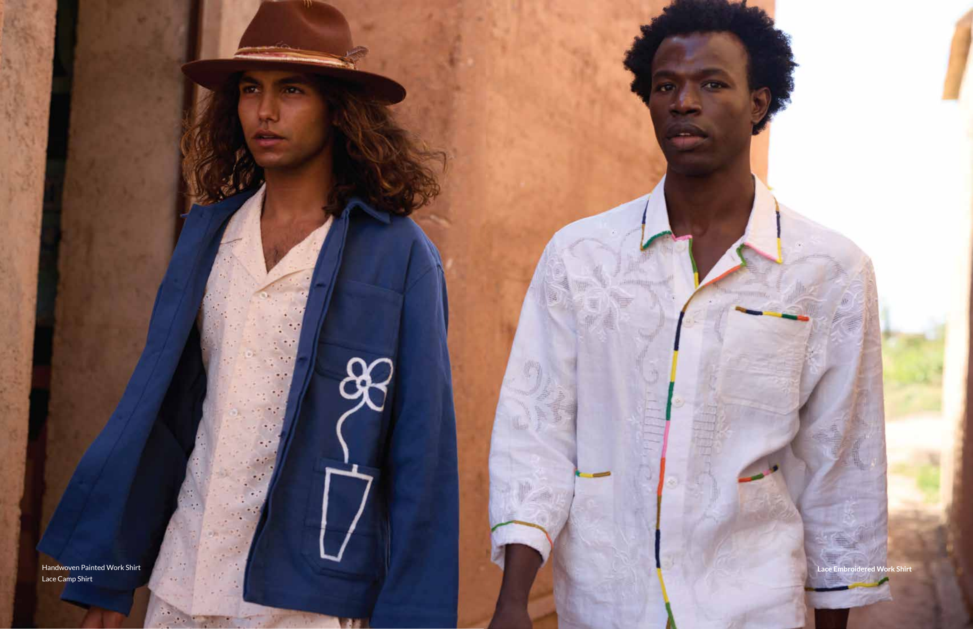
Handwoven Painted Work Shirt Lace Camp Shirt