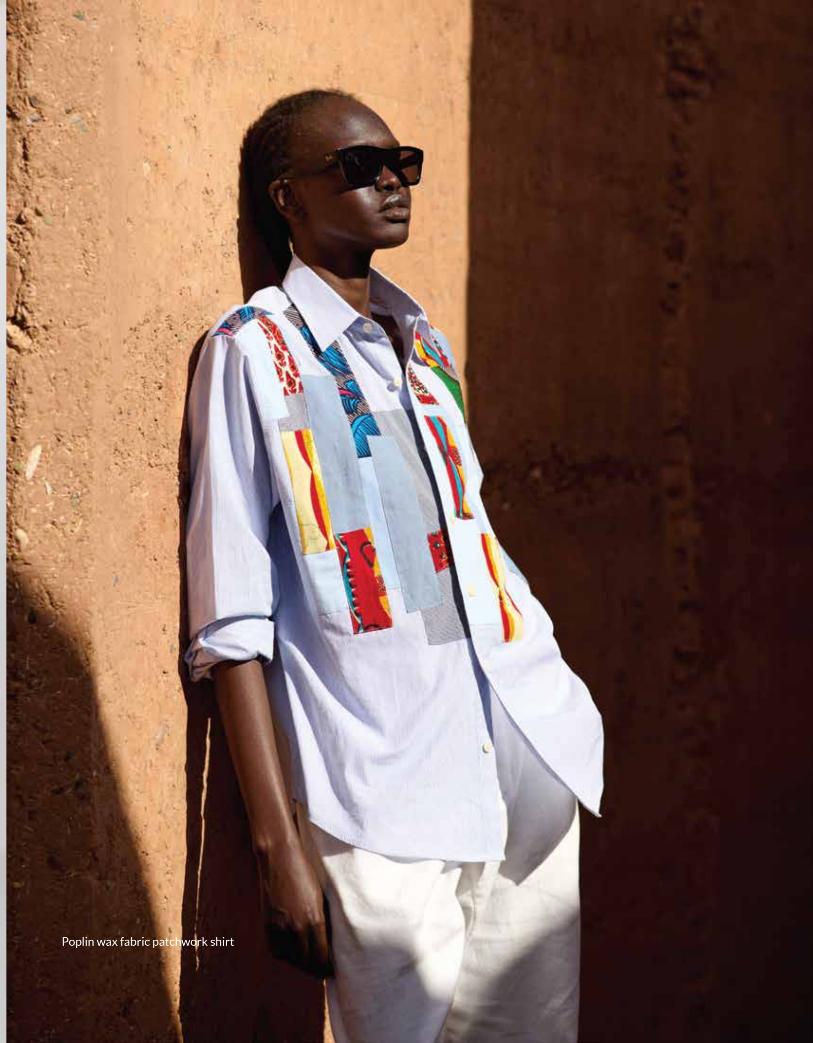
Poplin wax fabric patchwork shirt