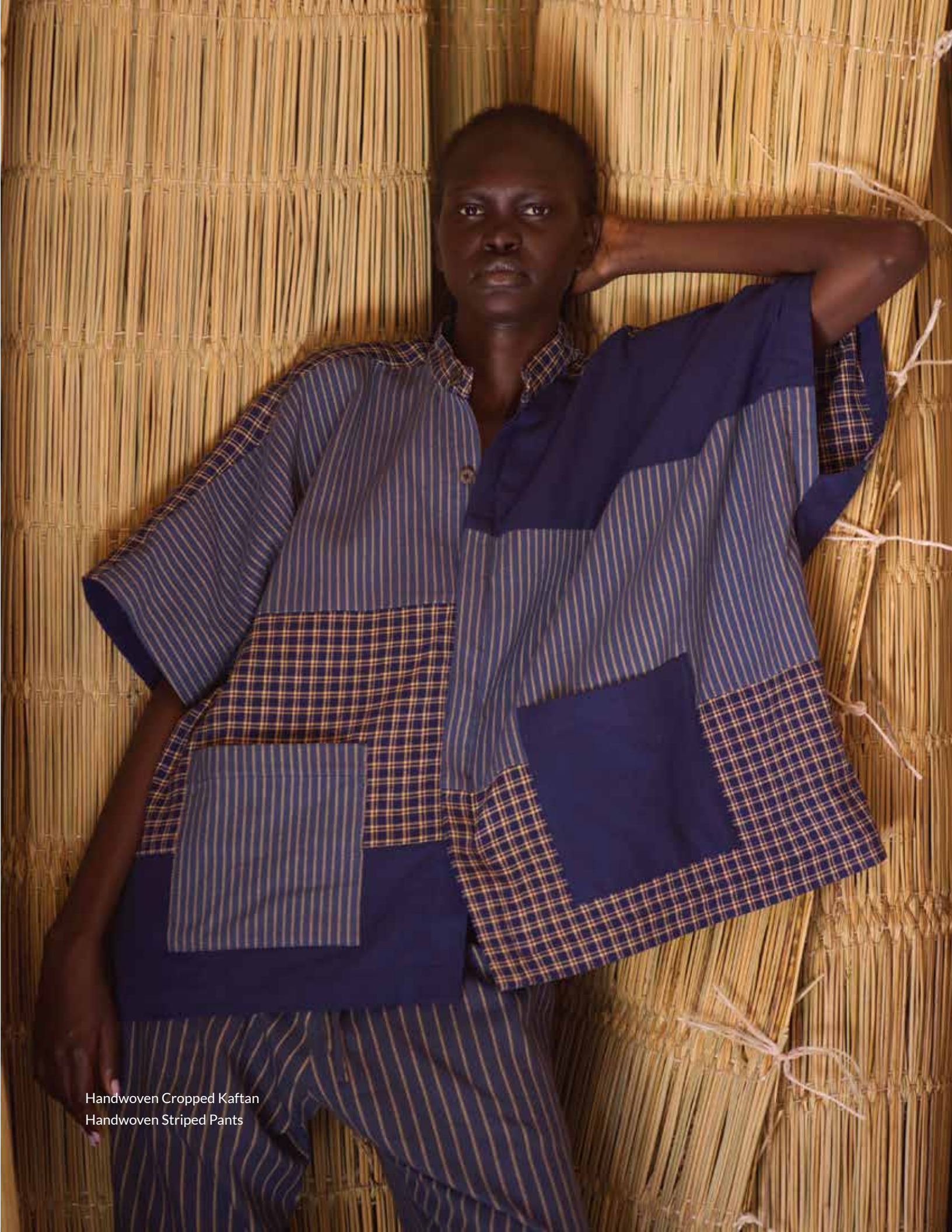
Handwoven Cropped Kaftan Handwoven Striped Pants