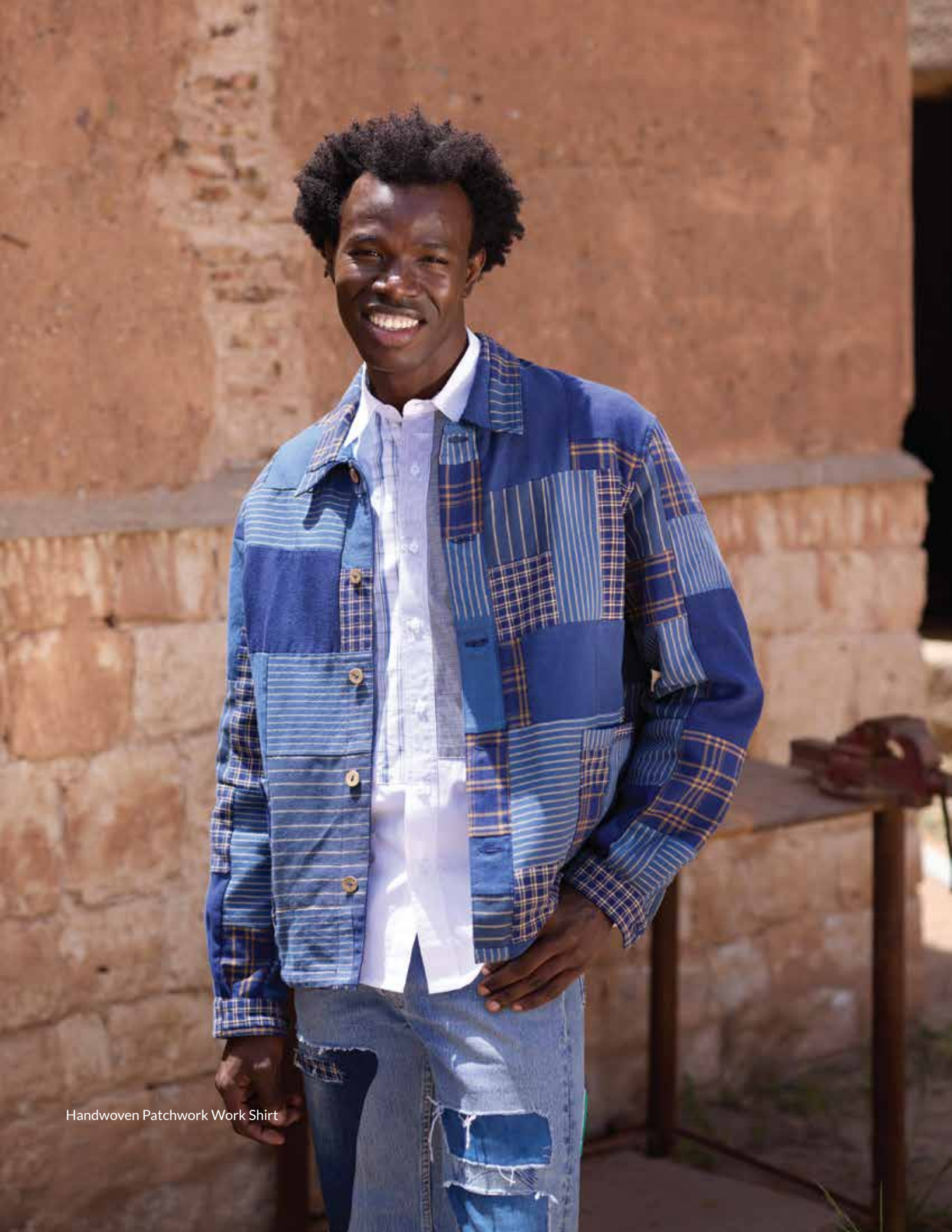
Handwoven Patchwork Work Shirt