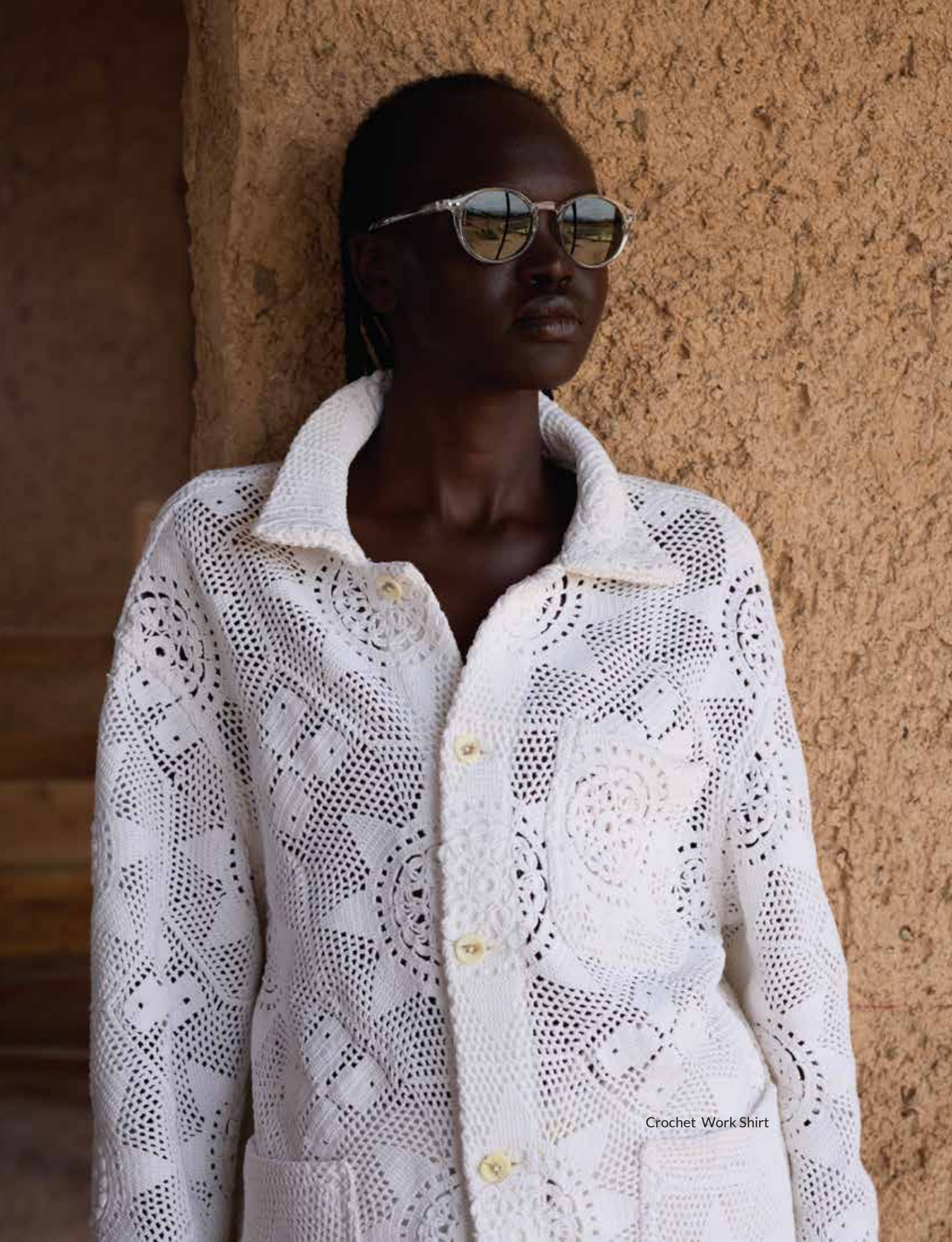
Crochet Work Shirt