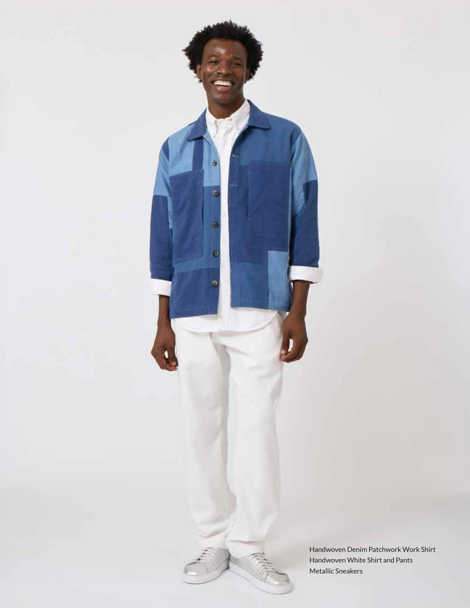
Handwoven Denim Patchwork Work Shirt Handwoven White Shirt and Pants Metallic Sneakers