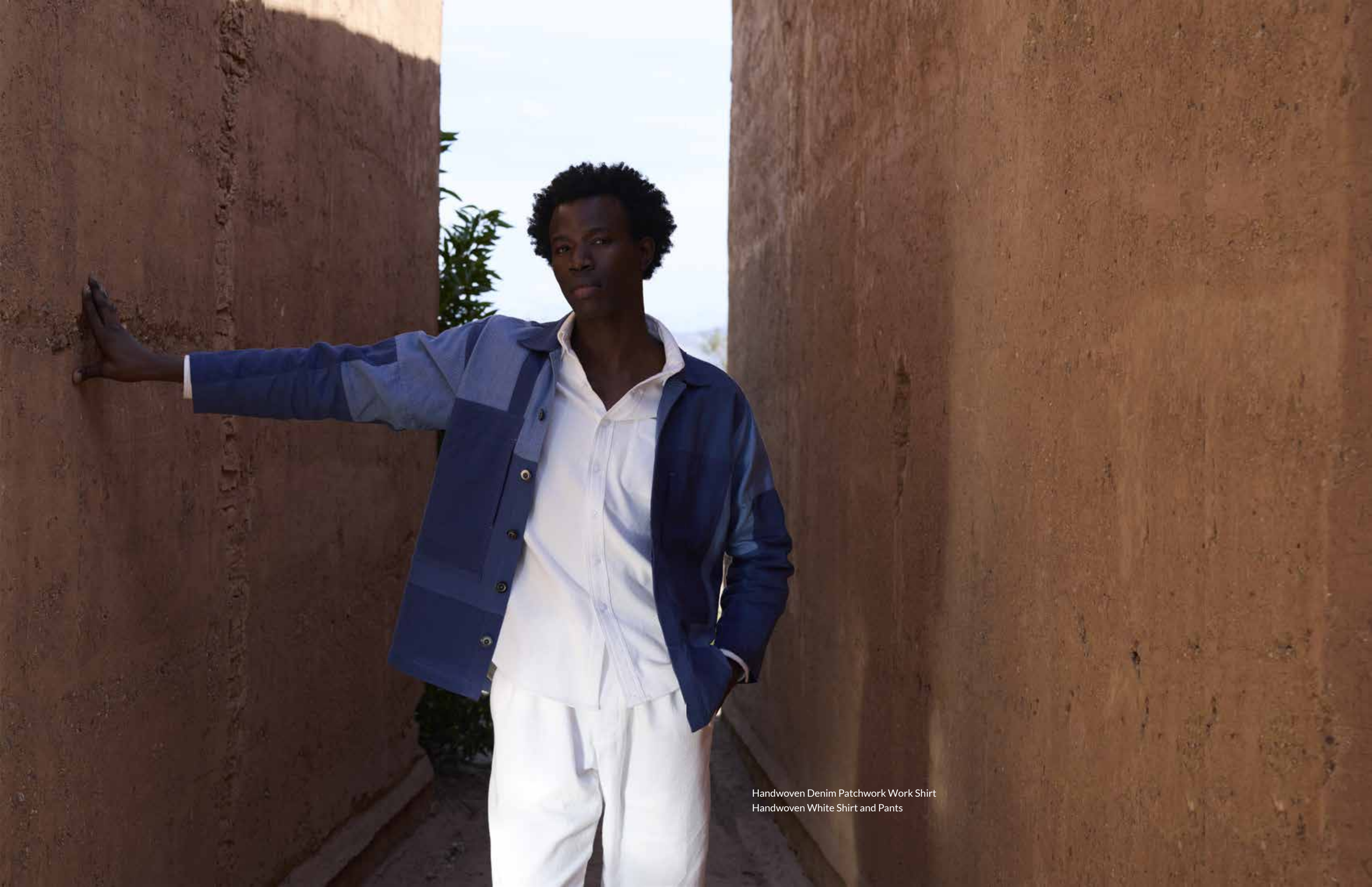
Handwoven Denim Patchwork Work Shirt Handwoven White Shirt and Pants