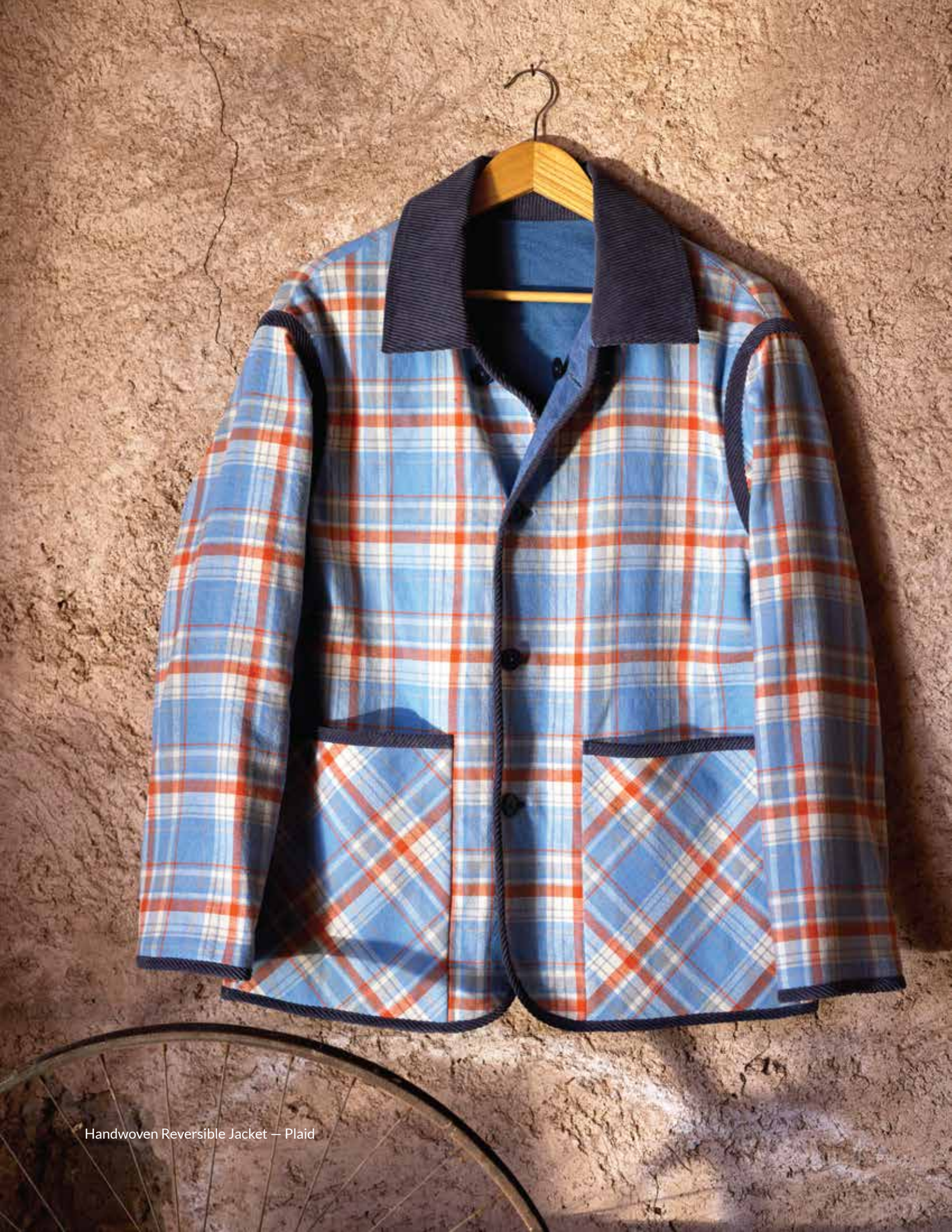
Handwoven Reversible Jacket — Plaid