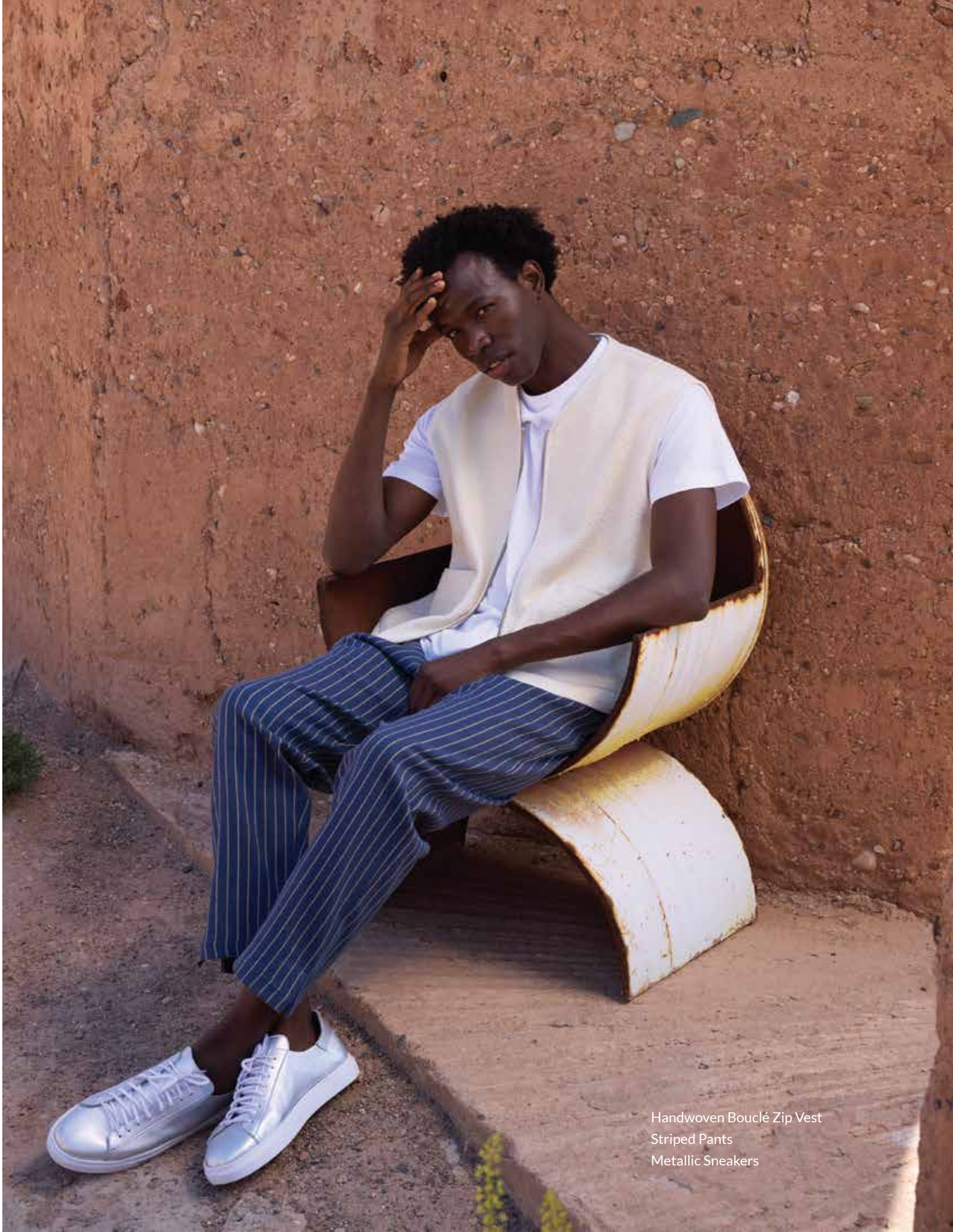
Handwoven Bouclé Zip Vest Striped Pants Metallic Sneakers