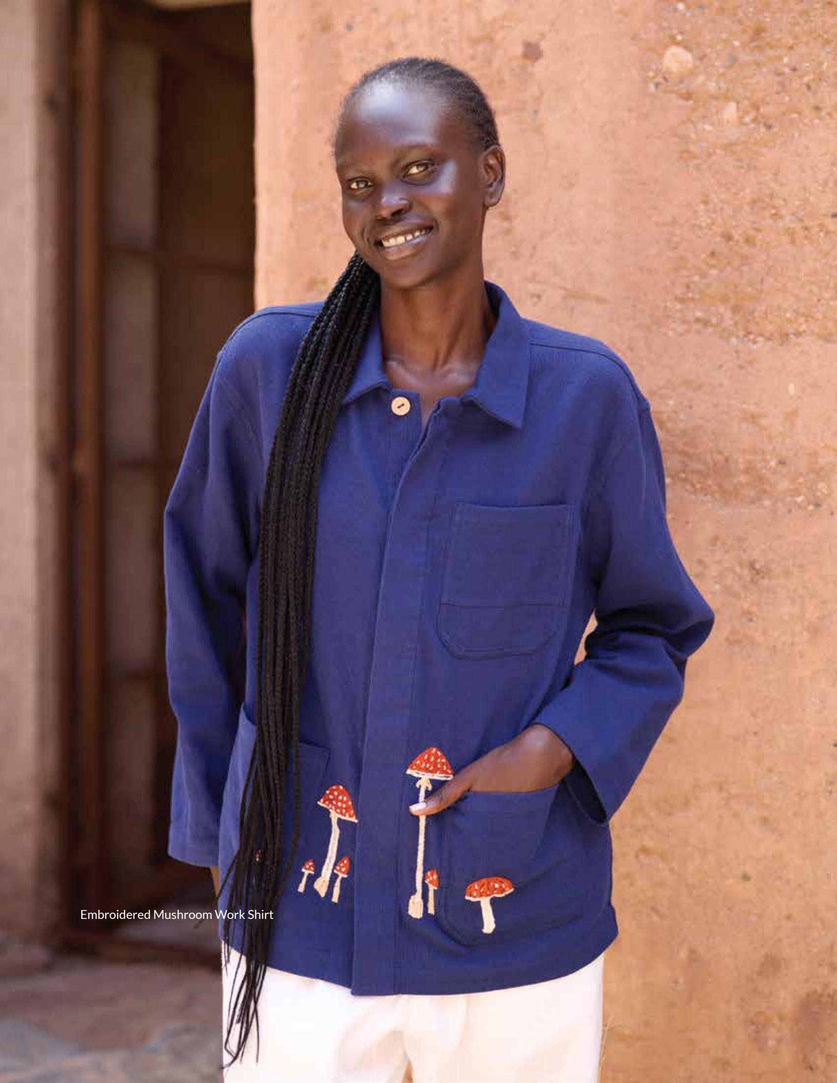
Embroidered Mushroom Work Shirt