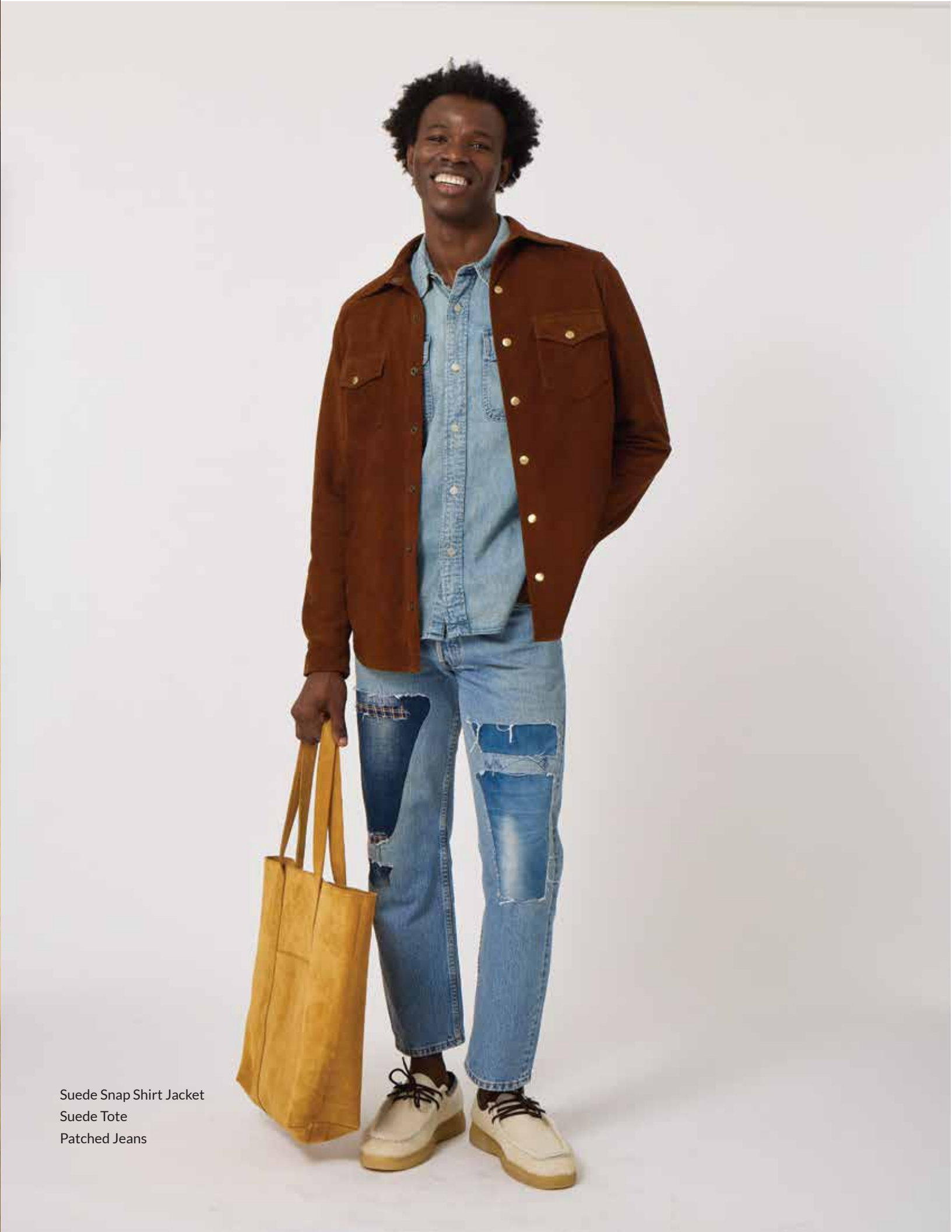
Suede Snap Shirt Jacket Suede Tote Patched Jeans