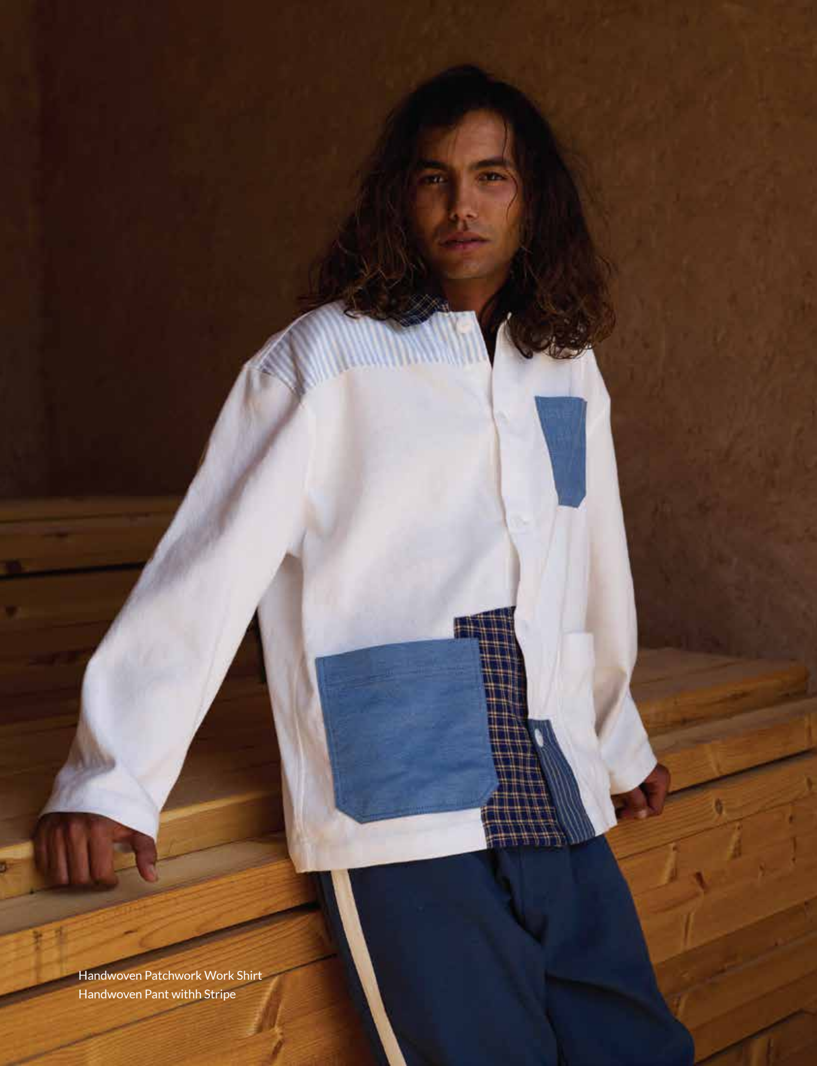
Handwoven Patchwork Work Shirt Handwoven Pant withh Stripe