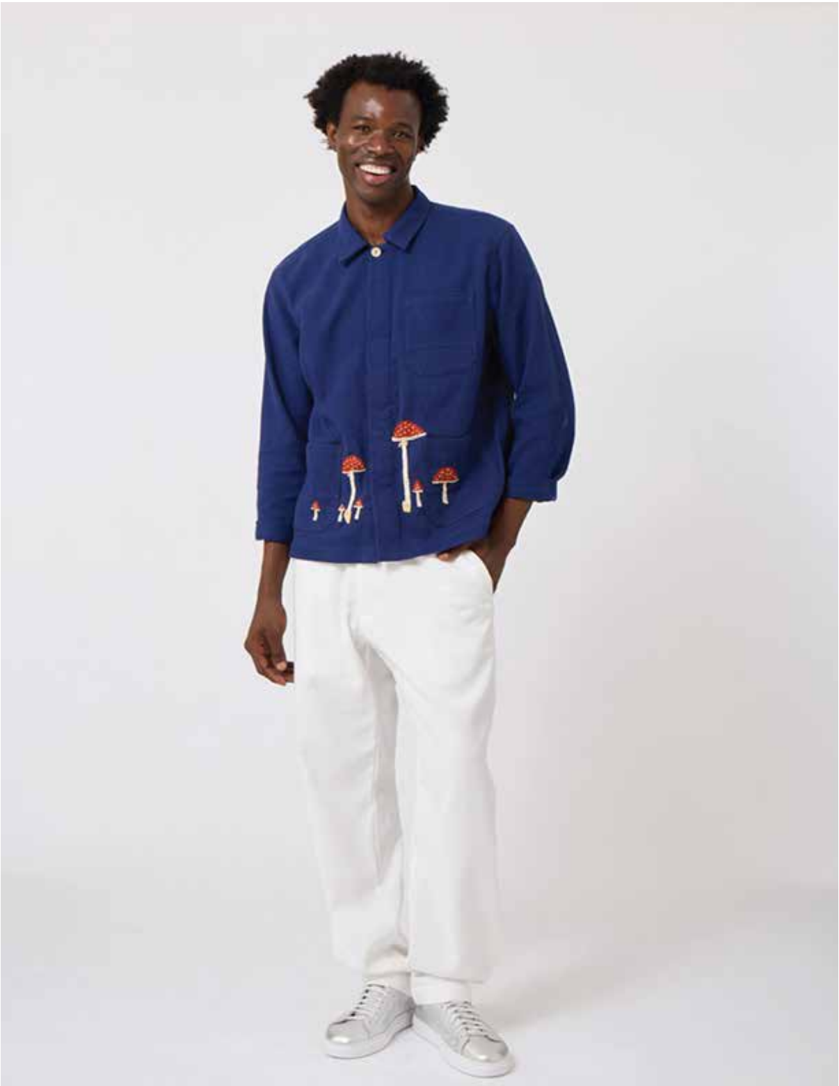
Handwoven Pants Handwoven Embroidered Mushroom Work Shirt