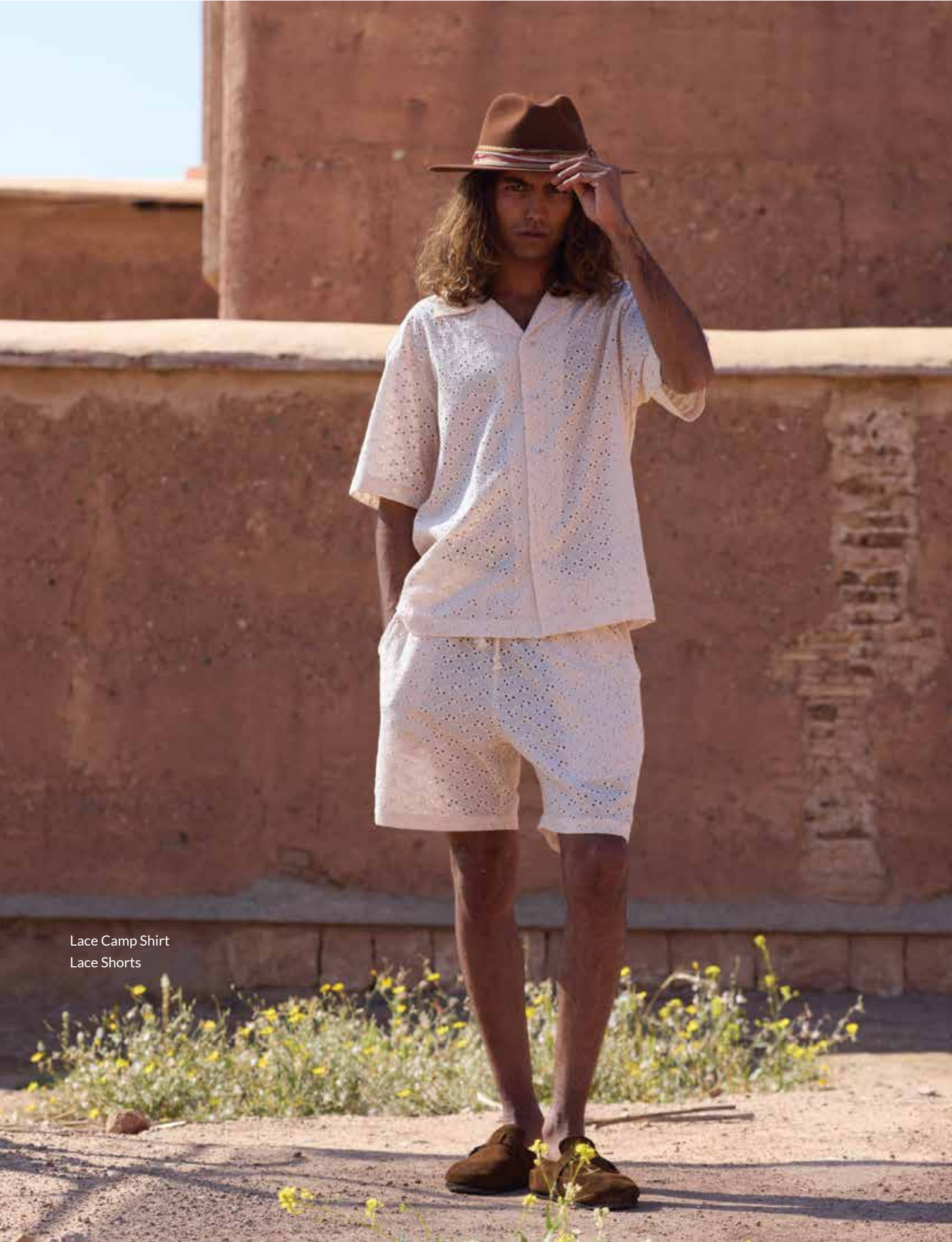
Lace Camp Shirt Lace Shorts