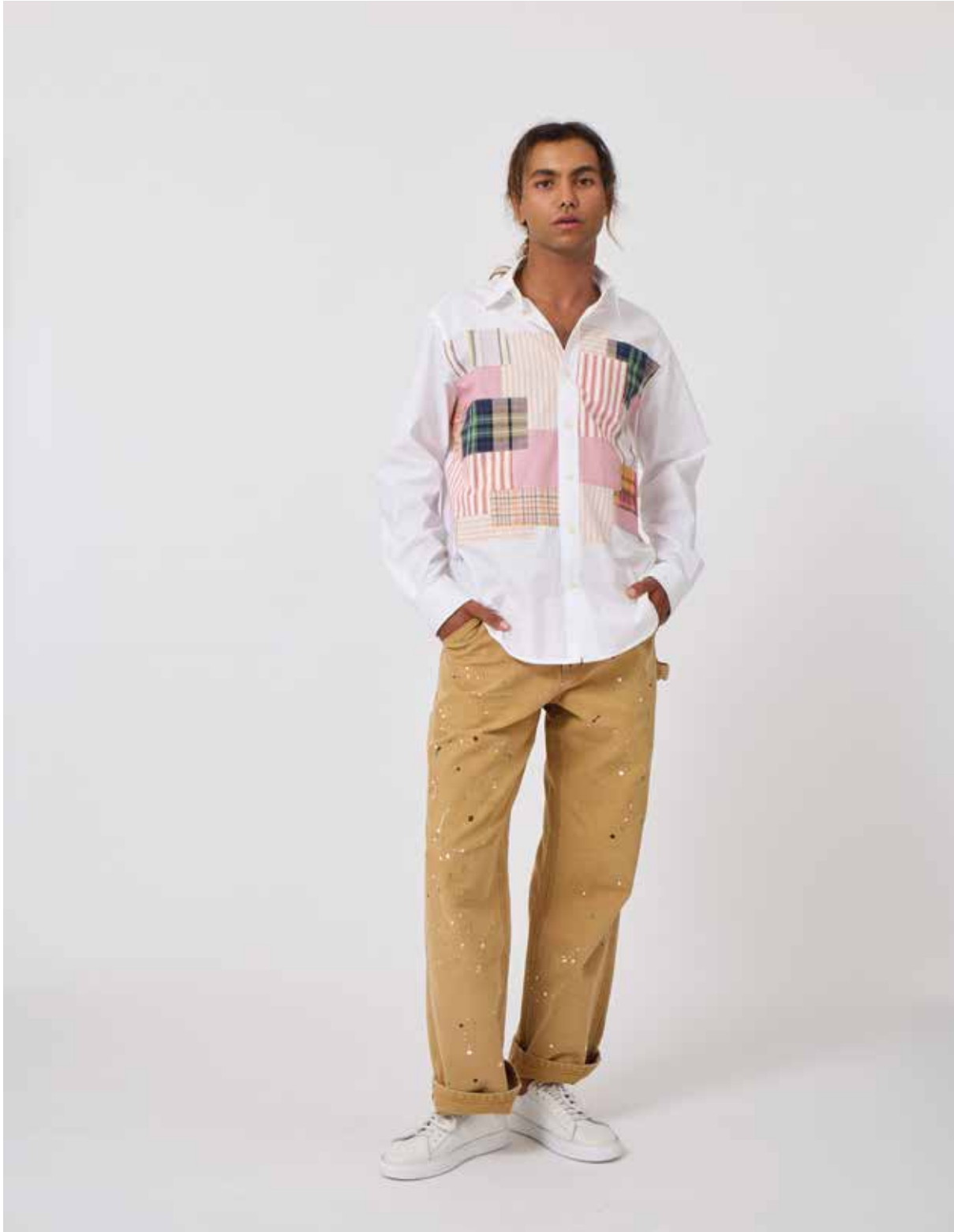
Poplin Patchwork Shirt Painters Pants