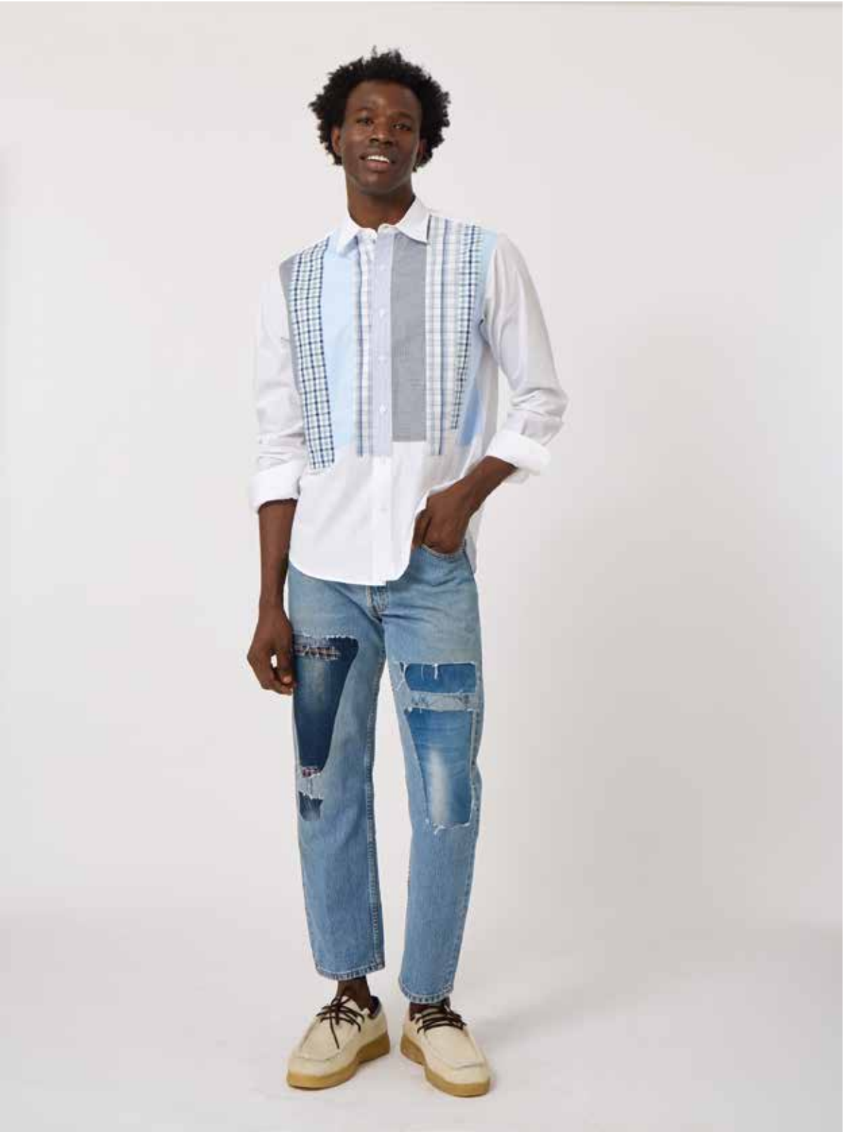
Poplin Patchwork Shirt Patchwork Jeans