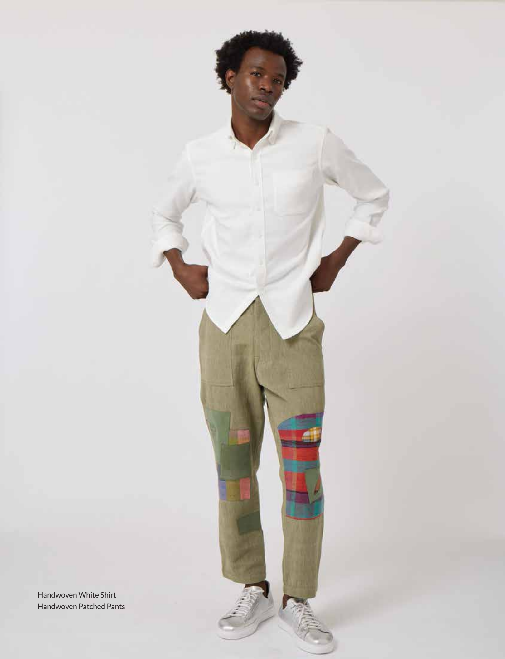
Handwoven White Shirt Handwoven Patched Pants