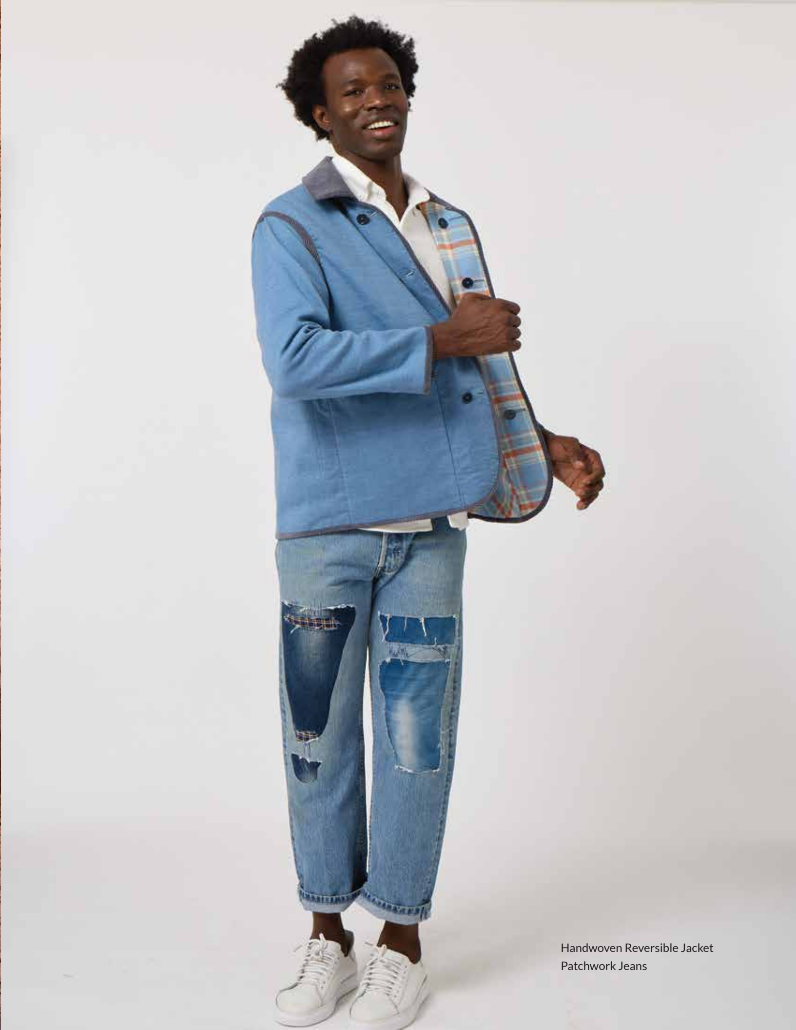
Handwoven Reversible Jacket Patchwork Jeans